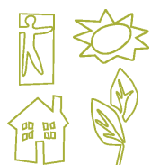
table of contents | PART 2